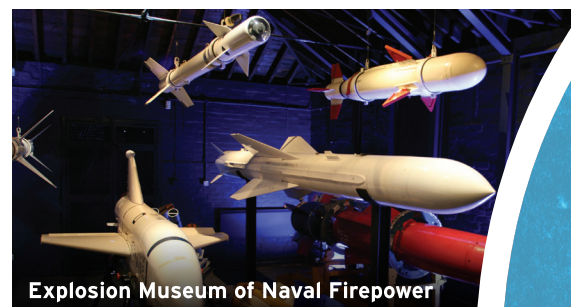
Explosion Museum of Naval Firepower