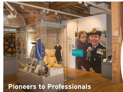
Pioneers to Professionals

In the centenary year of the Women's Royal Naval Service, Pioneers to Professionals , new for 2017 at The National Museum of the Royal Navy Portsmouth , tells the compelling tale of women's 250 year-long service. At Explosion , hear the incredible personal stories of the 662 female munition workers from the First World War. From multi-media installations to blockbuster features, 100s of stories are imaginatively told, capturing the unique history of the navy.