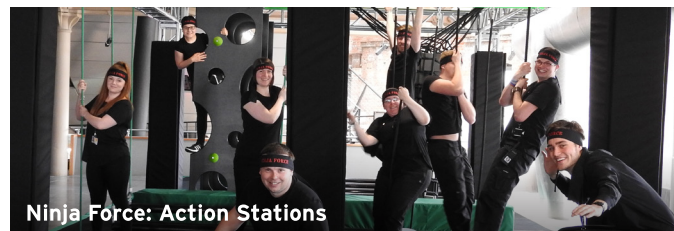
Ninja Force: Action Stations

Test your speed, stamina and courage at Action Stations , home to the new Making of a Royal Marines Commando challenge from Summer 2017. Take a flight in the helicopter simulator, run the 20m x 6m Ninja Force course and, for the very young, test your balance with Sky Tykes. Compare your strength against the archers of the Mary Rose . Be brave enough to climb the 8m tall mast in Boathouse 4 .