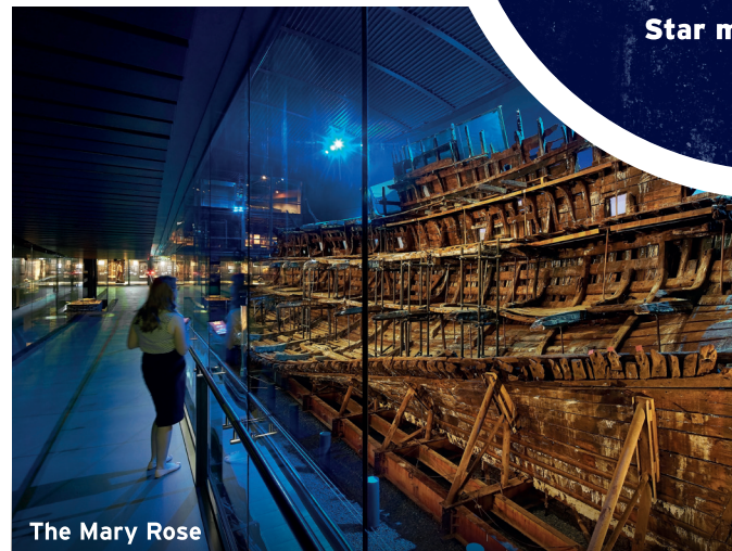
The Mary Rose

“Whether you're nuts about all things nautical or not, the Historic Dockyard is a fun day out.”