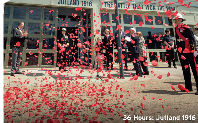
36 Hours: Jutland 1916