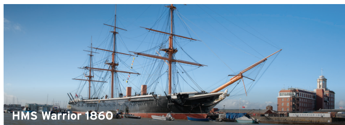
HMS Warrior 1860